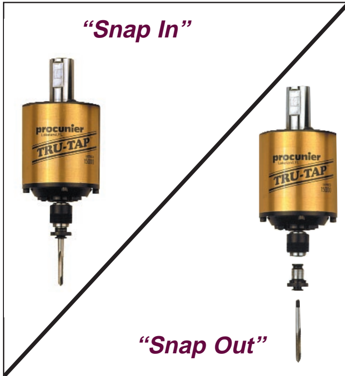
TRU-TAP for CNC Machines